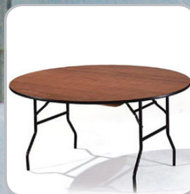
5' Round Tables