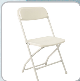
White Plastic Chairs