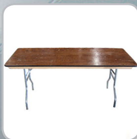
8' Banquet Tables