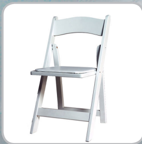
White Wood Chairs